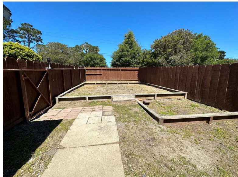
Fenced terraced garden area Access to bonus room

The information set forth herein has been received by us from sources we believe to be reliable.