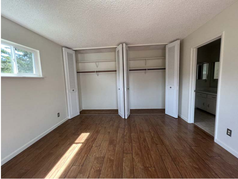
Master bedroom with master bathroom Laminate floors and slider to deck