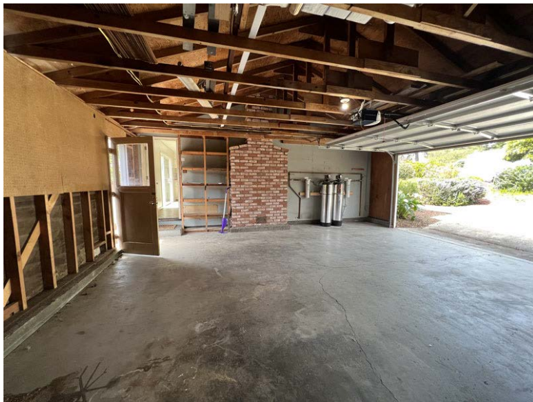
Two car garage with water filter & softener Bonus room