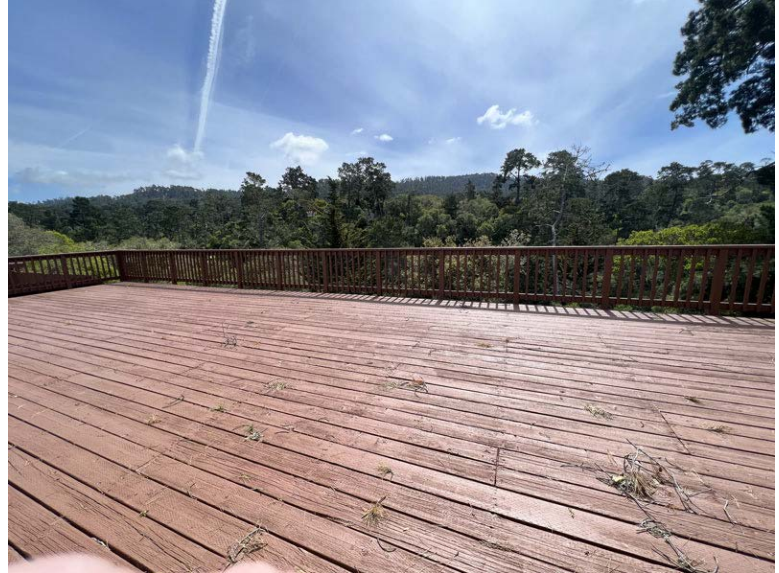
Scenic views from deck Access from den, dining and master bedroom