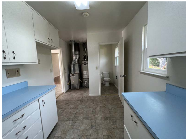
Laundry room with cabinets Half bathroom

The information set forth herein has been received by us from sources we believe to be reliable.