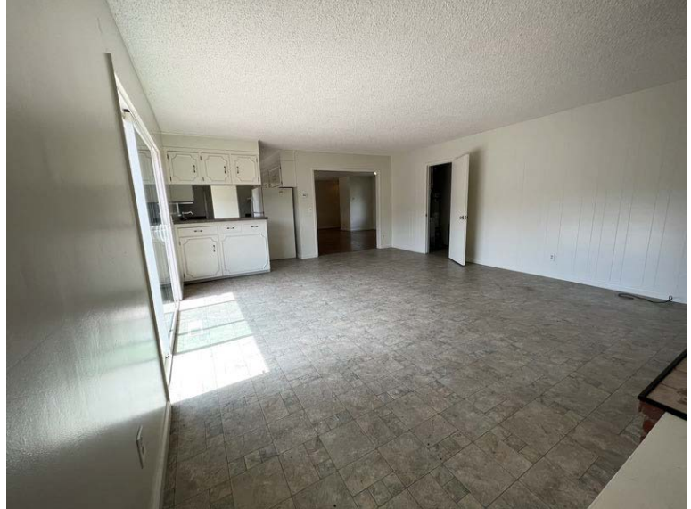
Den with view of kitchen and livingroom Access to deck, laundry room and garage