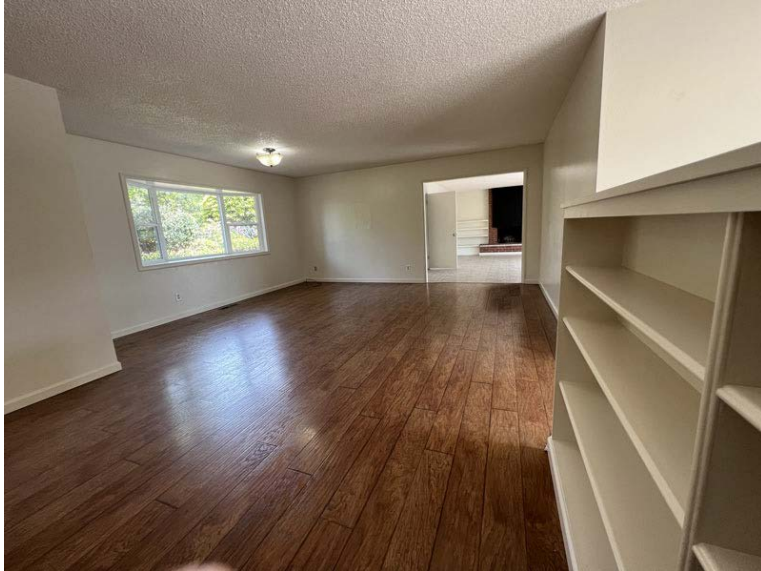
Livingroom with view of den and fireplace Laminate floors and bay window