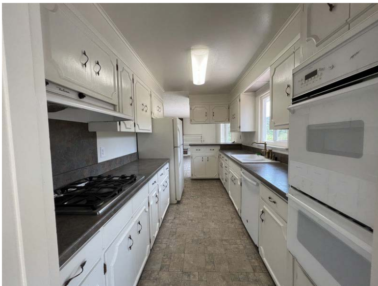
Kitchen with double oven, gas cooktop Scenic views from kitchen window