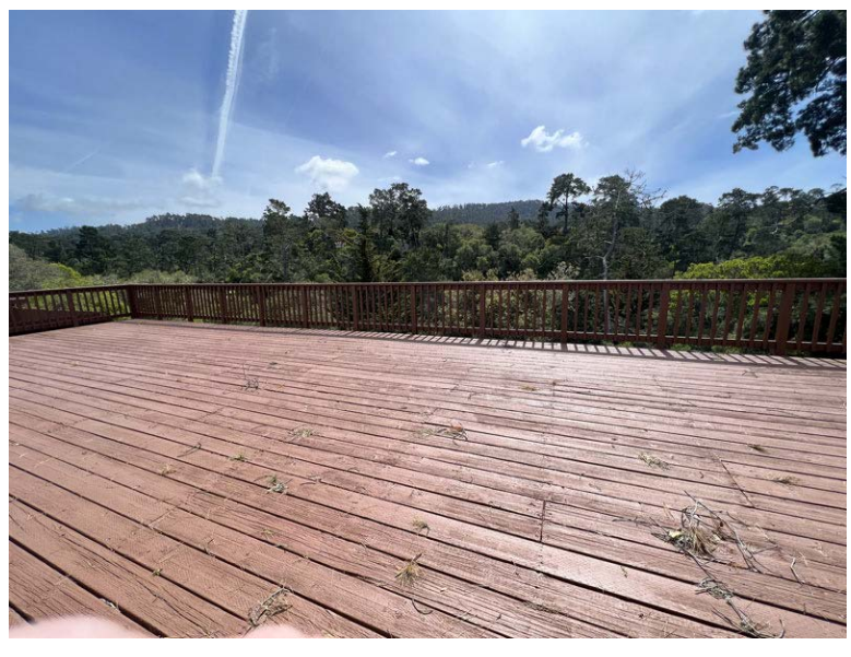
Scenic views from deck Access from den, dining and master bedroom