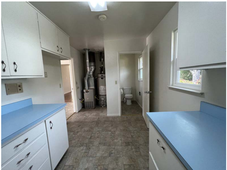
Laundry room with cabinets Half bathroom

The information set forth herein has been received by us from sources we believe to be reliable.