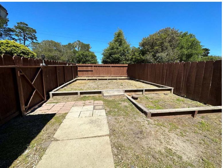
Fenced terraced garden area Access to bonus room

The information set forth herein has been received by us from sources we believe to be reliable.