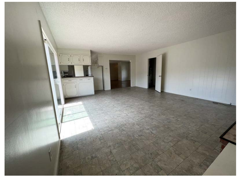
Den with view of kitchen and livingroom Access to deck, laundry room and garage