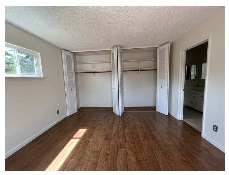
Master bedroom with master bathroom Laminate floors and slider to deck