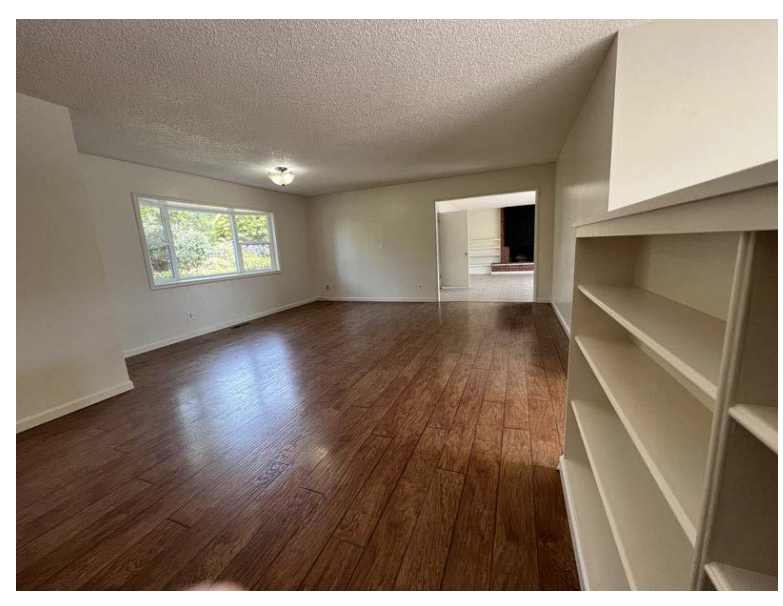
Livingroom with view of den and fireplace Laminate floors and bay window