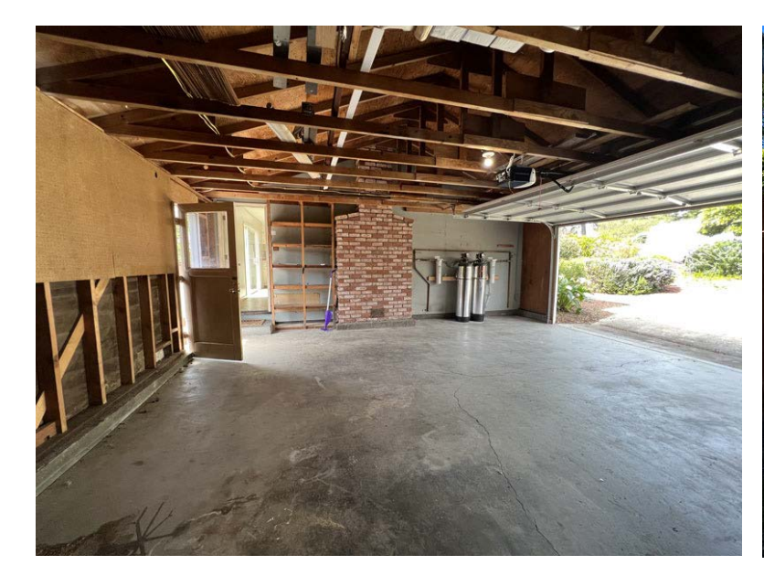
Two car garage with water filter & softener Bonus room