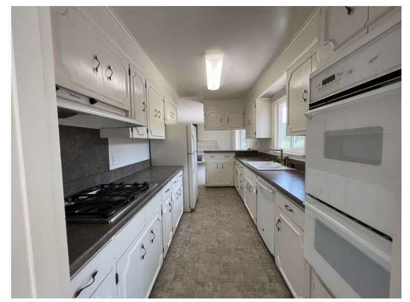
Kitchen with double oven, gas cooktop Scenic views from kitchen window